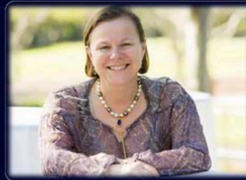
PROFESSOR FIONA WOOD