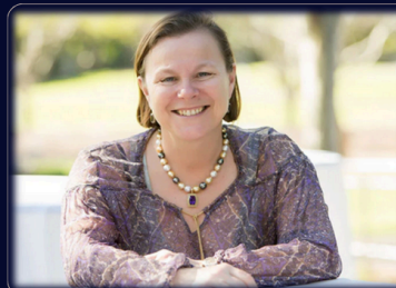
PROFESSOR FIONA WOOD