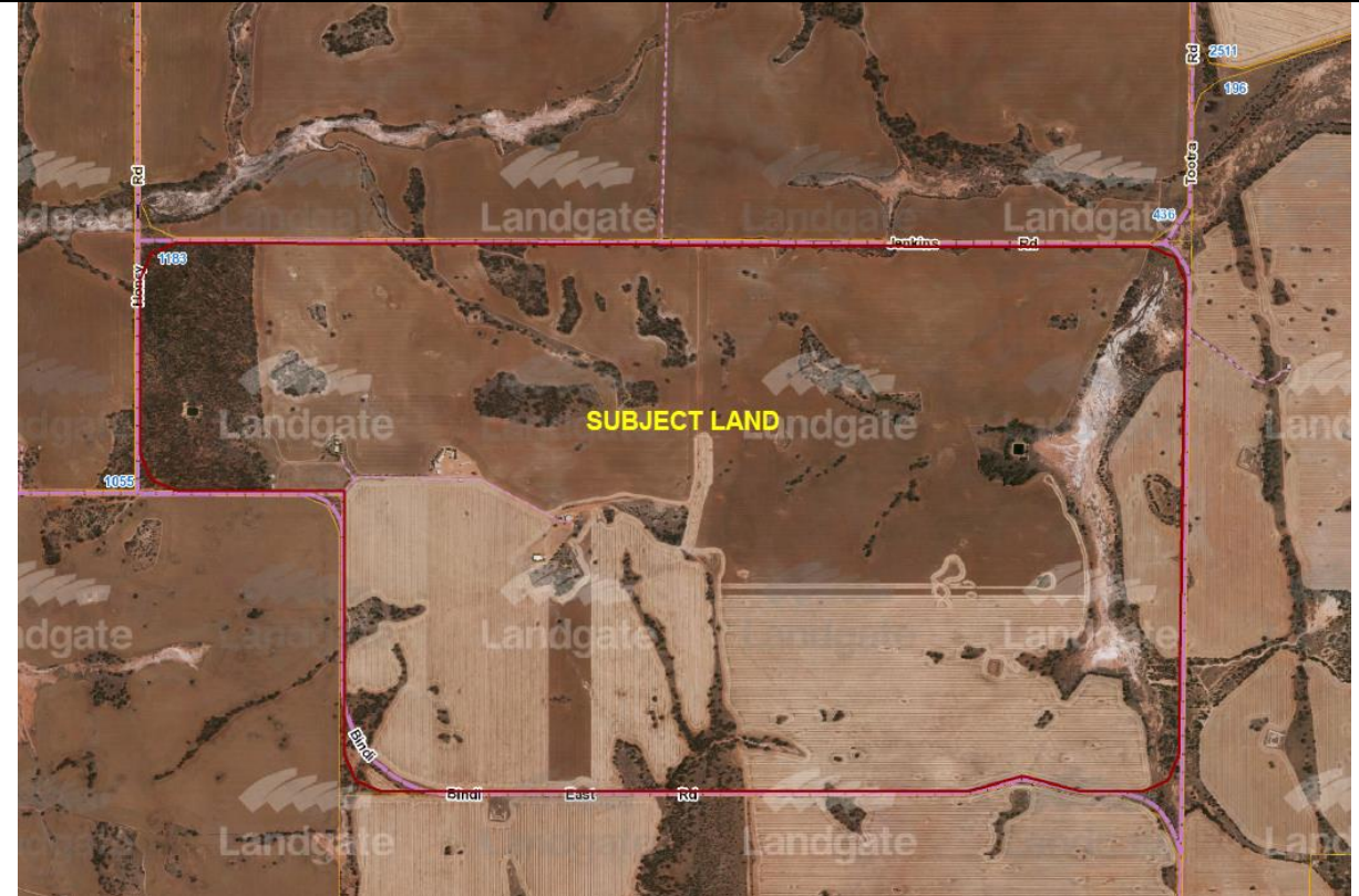
Location & Lot Configuration Plan

The subject land is gently sloping throughout with the natural ground level being approximately 310 metres AHD. It is largely cleared for broadacre cropping and grazing with scattered areas of native vegetation, the largest stand being approximately 45 hectares along the land's western boundary. There is no evidence to suggest the land is subject to any inundation or flooding.