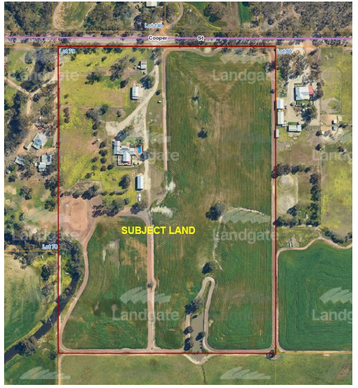
Location & Lot Configuration Plan

Lot 79 comprises a total area of approximately 10.964 hectares and is generally flat throughout with the natural ground level being approximately 200 metres AHD including the location where the sea container is proposed to be sited. The subject land has been extensively cleared with a few small stands of remnant vegetation remaining throughout. The land is also characterised by two (2) small creek lines in its southern half.