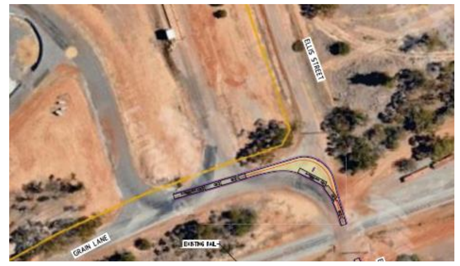
Swept Path Analysis Plan

Redesigning and reconstructing the intersection of Ellis Street and Grain Lane to address the current potential conflict issues in the event of a road train stopping at the railway crossing with its rear trailers overhanging into the westbound lane on Ellis Street which may block westbound traffic and cause queuing over the railway line <u>or</u> pavement repairs and resurfacing of this intersection if redesign and reconstruction are not considered feasible;