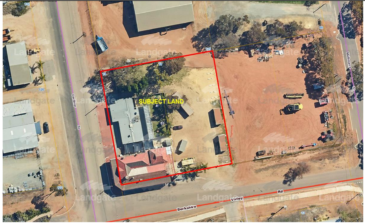
Location & Lot Configuration Plan

The land has been extensively cleared and developed for commercial purposes (i.e. the Junction Hotel) and contains a number of associated improvements including buildings, vehicle accessways, informal parking areas and landscaping. The land is also served by a wide range of key essential service infrastructure including power, water, reticulated sewerage, telecommunications and stormwater drainage.