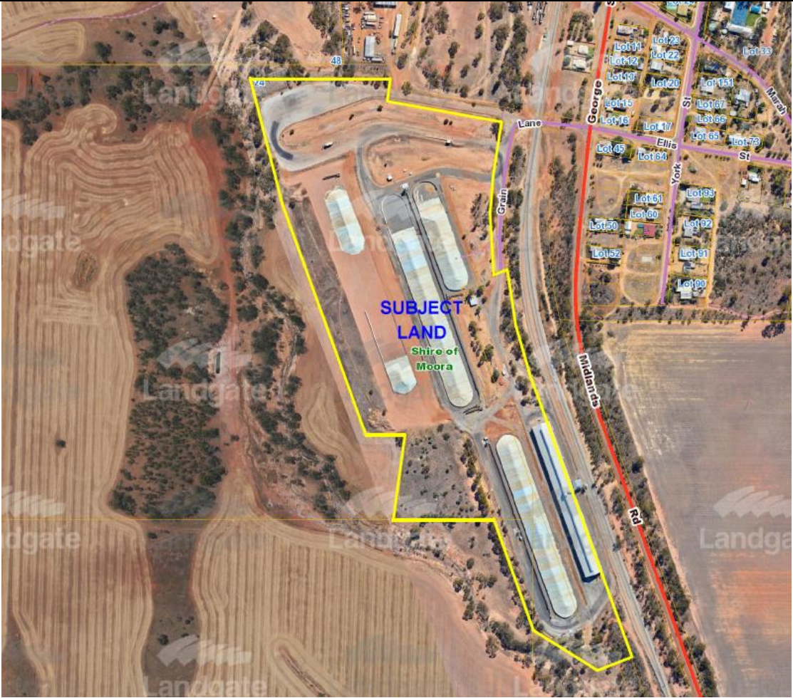
Location & Lot Configuration Plan