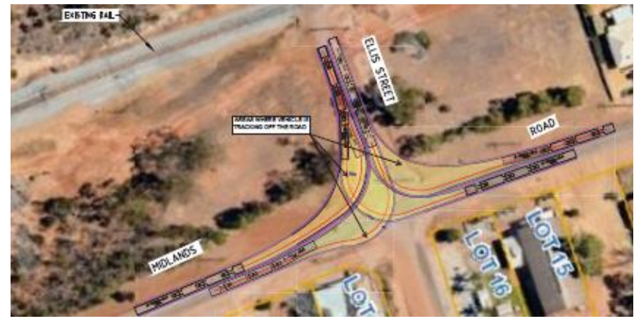
Swept Path Analysis Plan

Redesigning and reconstructing the intersection of Ellis Street and Midlands Road, including road shoulders, which has insufficient width to accommodate safe and convenient turning movements for RAV 7 rated heavy vehicles <u>or</u> pavement repairs and resurfacing of this intersection if redesign and reconstruction are not considered feasible;