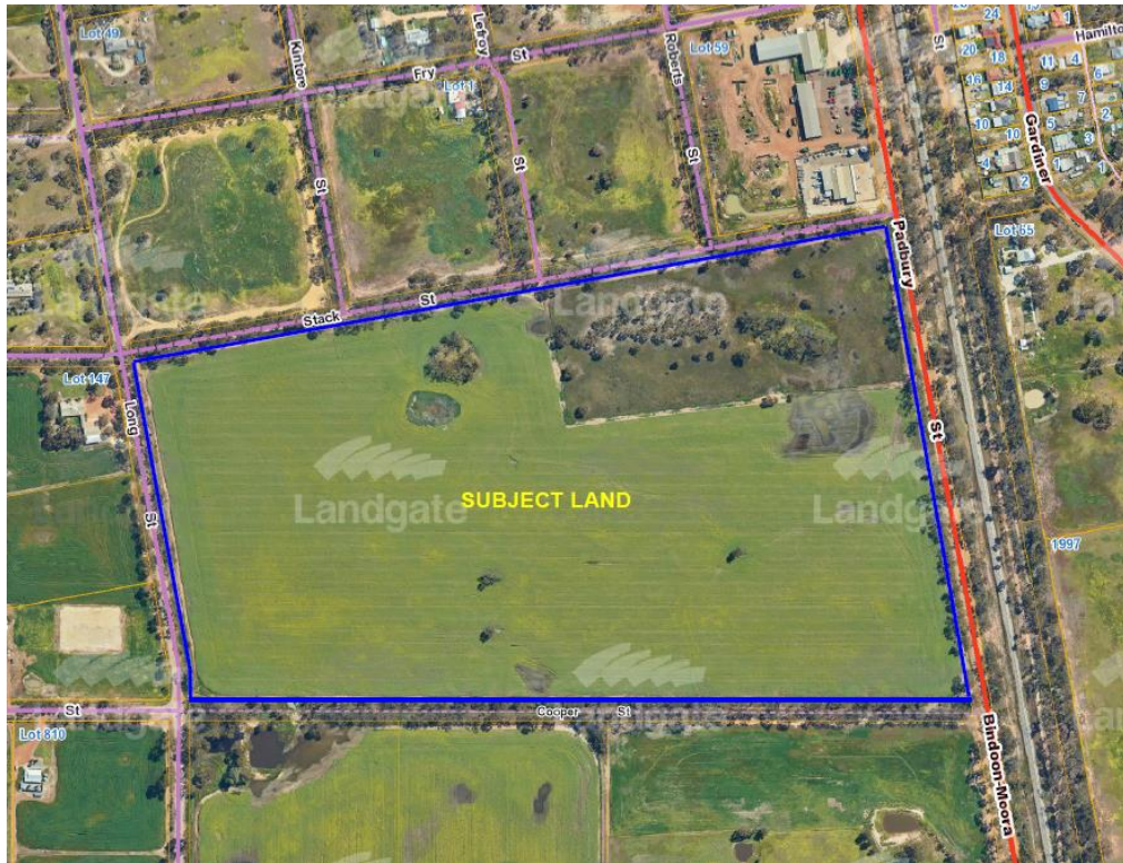
Location & Lot Configuration Plan

Immediately adjoining and other nearby land uses include: