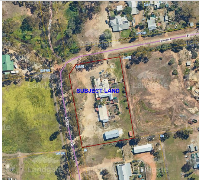
Location & Lot Configuration Plan