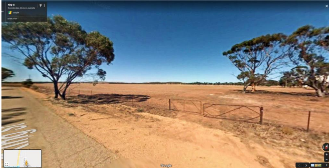
View of Subject Land from its Street Frontage to the South-East

It is the reporting officer's view that the walls of the ancillary accommodation building should be finished using similar materials and colours to the proposed double storey dwelling in the front portion of the land to ensure the development may be evident, but not visually prominent in its local setting (i.e. it borrows from and blends with its existing landscape setting rather than draws attention to itself). A condition has therefore been included in the recommendation for approval to reflect this preferred design outcome. It is acknowledged that this is a subjective matter. As such Council can choose to remove the relevant condition and associated advice note (i.e. Condition 5 & Advice Note 3) if it considers the officer's views and concerns are unwarranted.