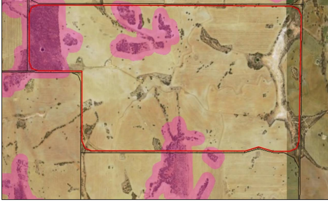
Subject Land