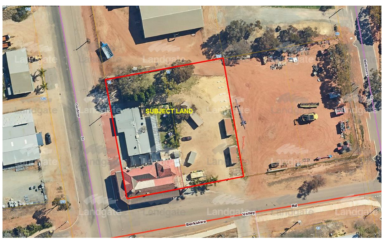
Location & Lot Configuration Plan

Lots 30 and 31 are located in the north-eastern part of the Moora townsite in a dedicated commercial precinct and comprise a total combined area of approximately 3,642m². The subject land is generally flat throughout its entire area with the natural ground level being approximately 203.5 metres AHD and has direct frontage and access to Berkshire Valley Road immediately south and Gardiner Street immediately west, both of which are sealed and drained local roads under the care, control and management of the Shire of Moora.