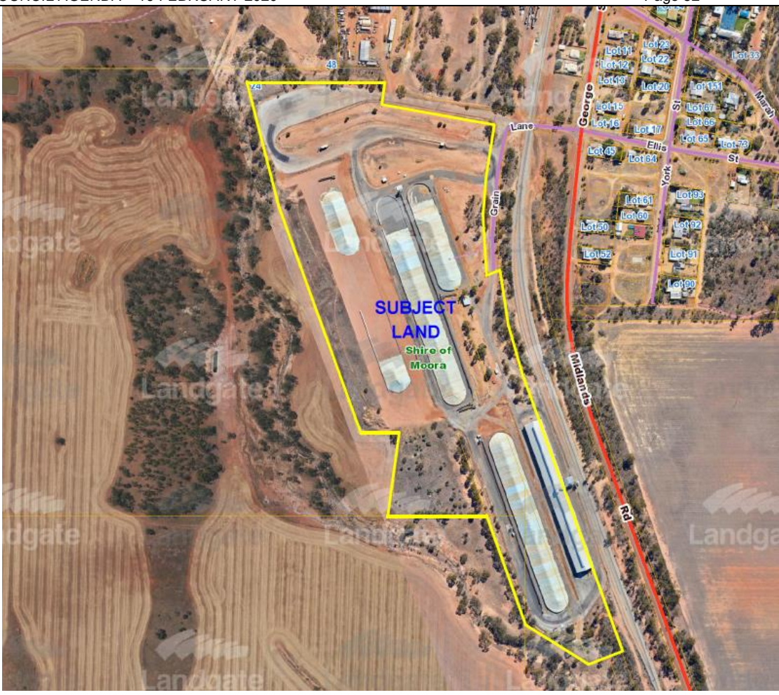
Location & Lot Configuration Plan