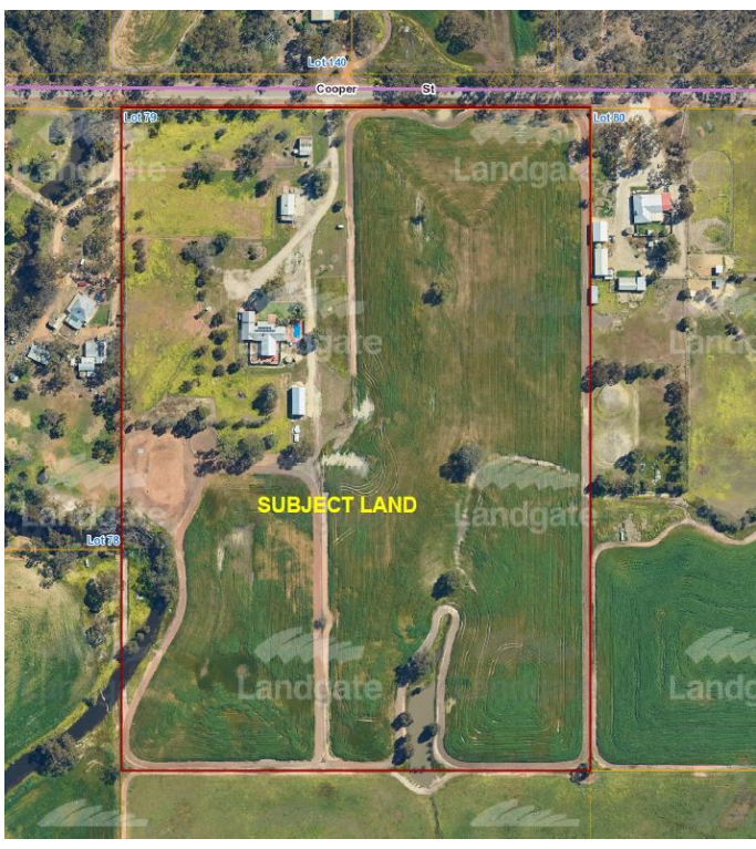
Location & Lot Configuration Plan

Lot 79 comprises a total area of approximately 10.964 hectares and is generally flat throughout with the natural ground level being approximately 200 metres AHD including the location where the sea container is proposed to be sited. The subject land has been extensively cleared with a few small stands of remnant vegetation remaining throughout. The land is also characterised by two (2) small creek lines in its southern half.