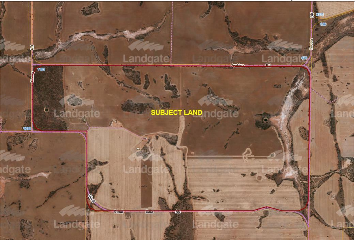
Location & Lot Configuration Plan

The subject land is gently sloping throughout with the natural ground level being approximately 310 metres AHD. It is largely cleared for broadacre cropping and grazing with scattered areas of native vegetation, the largest stand being approximately 45 hectares along the land's western boundary. There is no evidence to suggest the land is subject to any inundation or flooding.