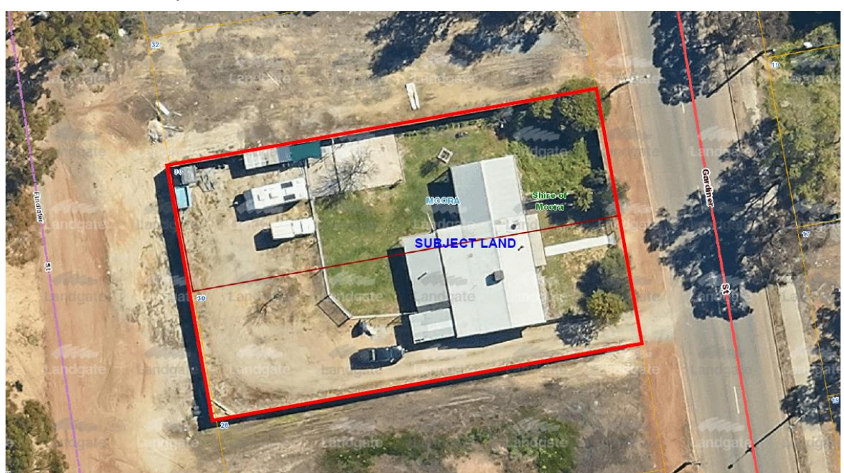
Location & Lot Configuration Plan

The applicant is seeking Council's development approval to construct a new 96m² outbuilding (i.e. shed) and 72m² carport (i.e. awning) on Lot 14 (No.30) Gardiner Street, Moora for domestic storage purposes and private vehicle parking with all access via the adjoining Lot 15 located immediately south.